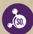
Sulphur Dioxide and Sulfites